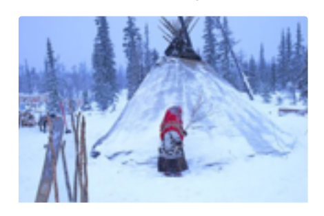
Ideas for handling the cold without modern conveniences. Read more