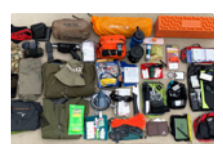
See exactly what you need to buy and in what order. Read more